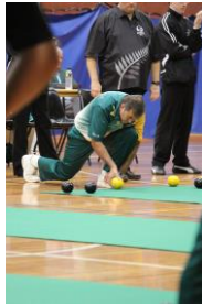
Our Queensland players in action