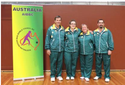
The winning Mixed Fours