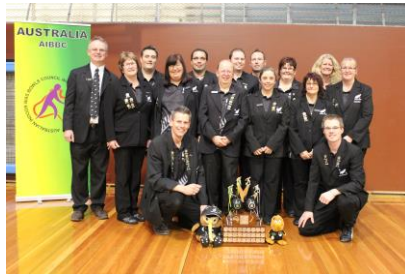
A very happy New Zealand Team.