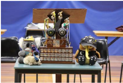
The Trans-Tasman Trophy

The QIBA would like to give a special thanks to all those who helped with the smooth and professional way everything was organised.