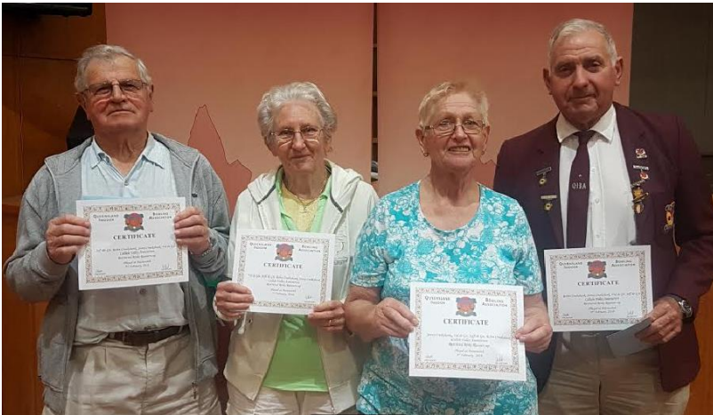
Callide Valley Association